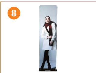
8. Completed Snello frame with graphic.