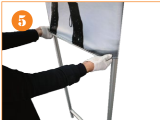
5. To install the graphic, slide the graphic from the top of the frame towards the bottom.