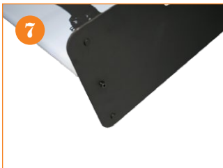
7. Attach base with provided screws.