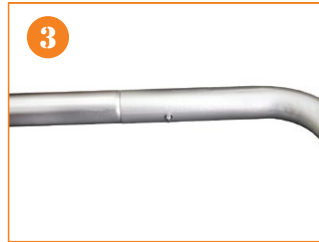
3. Arrange and assemble the frame by connecting the tubes together.