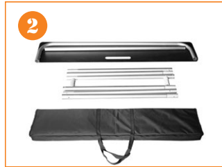
2. Take out the parts of the frame from the bag.