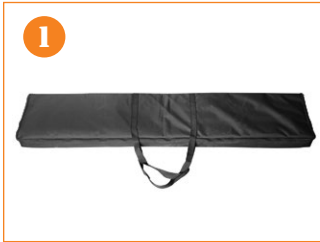
1. Snello black padded bag.