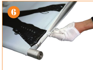
6. Zip the bottom of the graphic.