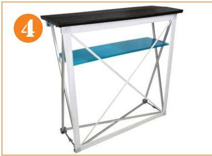
4. Place the board on top of the counter.