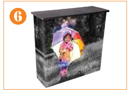
6. Completed Lope pop up counter with graphic.