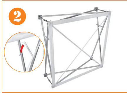
2. Open the frame