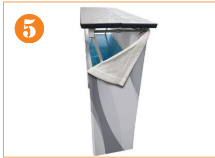
5. Attach the graphic around the velcro.