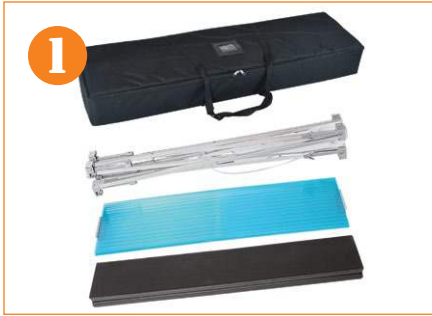
1. Take out the hardware from the bag.