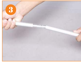
3. Connect the telescopic clip pole.