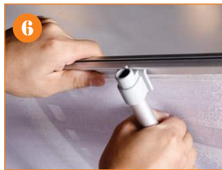
6. Attach the top bar on the top clamp profile.